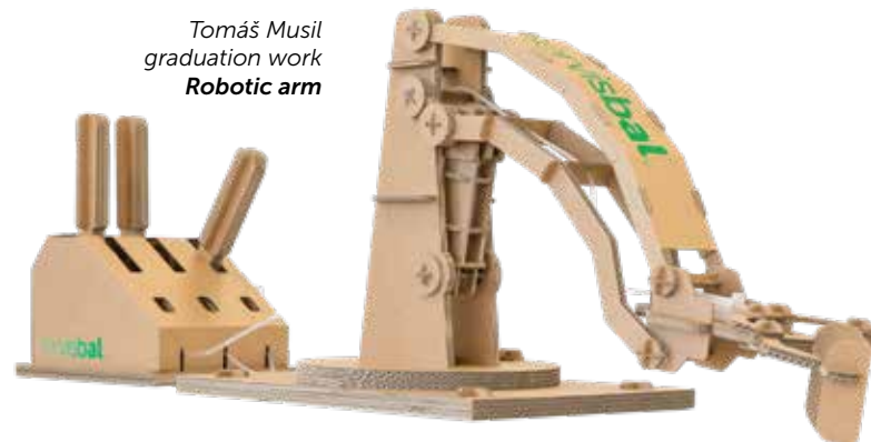
Tomáš Musil graduation work Robotic arm

It comes with certain risks, but it pays off. It is important to have a sophisticated system of internal training and mutual transfer of experience.